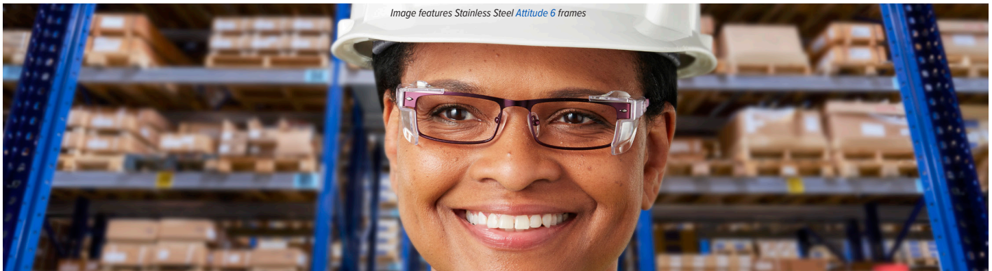
Image features Stainless Steel Attitude 6 frames

Size 63-18-122 Color Matte Black | Silver | Red Temple Standard Side Shields Integrated