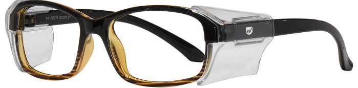
Dark Brown Stripe

Size 54-18-135 Color Black/Clear | Dark Brown Stripe | Tortoise/Orange Temple Standard Side Shields Standard