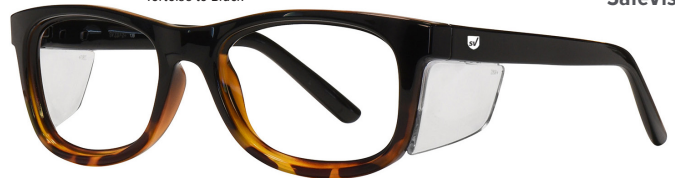
Tortoise to Black

Size 54-20-139 Color Matte Black | Tortoise to Black | Espresso Brown Temple Standard Side Shields Standard