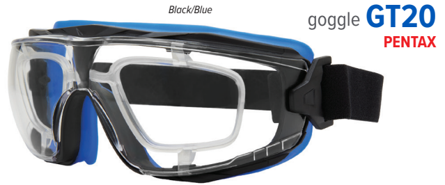
goggle GT20 PENTAX

Includes removable Rx insert Size 50-20-strap (Rx insert) Color Black/Blue Temple Head strap Side Shields Integrated