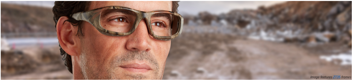
Image features Z135 frames

Size 65-16-120 Color Gloss Black | Matte Navy | Matte Tortoise | Pearl/Orange Temple Standard Side Shields Integrated